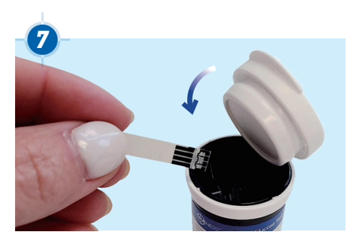
Remove one test strip from vial. Close vial immediately. Use test strip quickly after removal from vial.