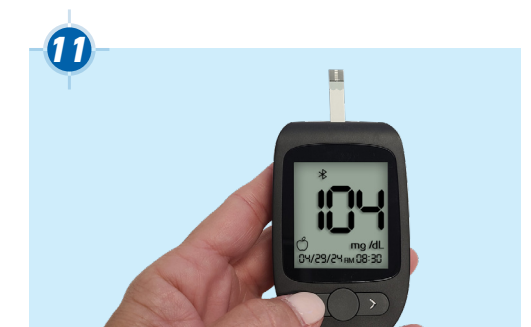
After a 5-second count down, meter displays the test result.